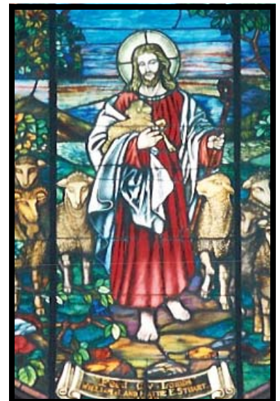
Community Congregational Church United Church of Christ 1895-2009